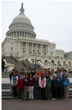
Students visiting Washington D.C.

their language. GCS holds community blood drives and food drives, and helps our area crisis pregnancy center. Organizations such as honor society provide for other unique opportunities to serve. Service related activities teach compassion and responsibility.