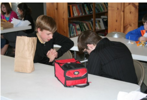
Prayer is an important part of each day.

Extracurricular: Honor Society, Student Council, Teens With A Mission (TWAM), School Play, School Newspaper, Yearbook, MACS Fine Arts Competition, Band, Choir, Washington Trip, Mackinac Trip